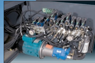
Easily Accessible Door Mounted Hydraulic System